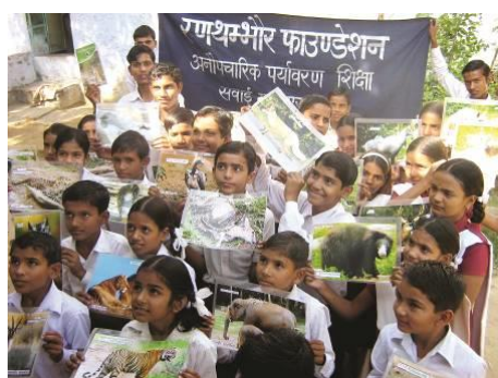
(Winner of TOFTigers Best Tourist- Related Community Initiative of the Year 2012 Award)

Join us in serving the combined interests of nature and the environment, communities and the economy for a sustainable future.