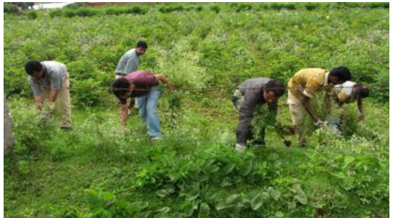
Clearing invasive weeds.

Educational sessions are also run for young adults from surrounding villages on sustainable practices.