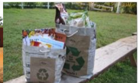
Guests encouraged to go eco through tours and classes.