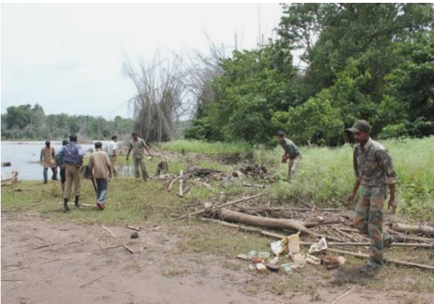
Clean up drives in the National Park....

The resort conducts periodic visits to local villages to weed out parthenium and eupatorium, invasive weeds, to enable beneficial vegetation to grow. It assists the Forest Department in periodic drives to clean Nagarhole National Park. Its staff also have clean-up drives in surrounding villages removing plastic and other waste to set an example to the local community.