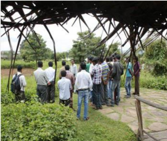
Building conservation awareness among young adults.

Educational sessions are also run for young adults from surrounding villages on sustainable practices.