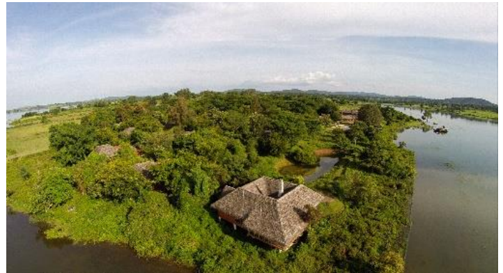
Denuded landscape restored - before and after restoration with indigenous planting and the creation of a water body.

Making a positive contribution to the local ecosystem and conservation of natural diversity lies at the heart of Orange County's responsible tourism policy, the parent company of Evolve Back Kabini. A plot of barren farmland with no green cover acquired in 2005 has been transformed by planting only local trees and plants with landscaping emulating the local terrain allowing bird, insect and small animal life to be restored. The resort has created an exceptional educational experience through their on-site Kabini Interpretation Centre - the Kabini Museum, Butterfly Sanctuary, Lily Pond and Kuruba Trival Hut designed to give a unique insight into a beautiful, environmentally and culturally fragile region.