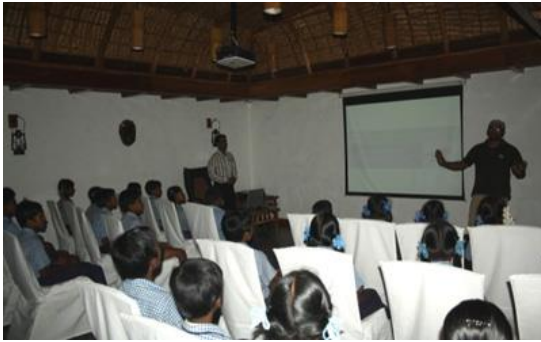
Conservation classes at the resort for local children.

The expertise of the resort's in-house naturalist is utilised to spread conservation awareness amongst the broader community. Conservation classes at the resort are held for children from their adopted school. The children are taken on wildlife safaris twice a year to inspire care for the fragile environment and the wildlife it harbours.