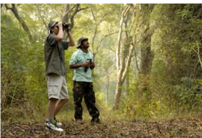
Low carbon opportunities to explore nature.

Guests are briefed by the resort's team of in-house naturalists on etiquette when visiting the park and given inspiring talks on nature. Low carbon opportunities to explore the natural environment and its inhabitants beyond the jeep and boat safari are provided on foot, by bullock cart and coracle.