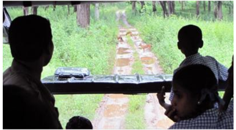
Giving local children access to their natural heritage.

The expertise of the resort's in-house naturalist is utilised to spread conservation awareness amongst the broader community. Conservation classes at the resort are held for children from their adopted school. The children are taken on wildlife safaris twice a year to inspire care for the fragile environment and the wildlife it harbours.