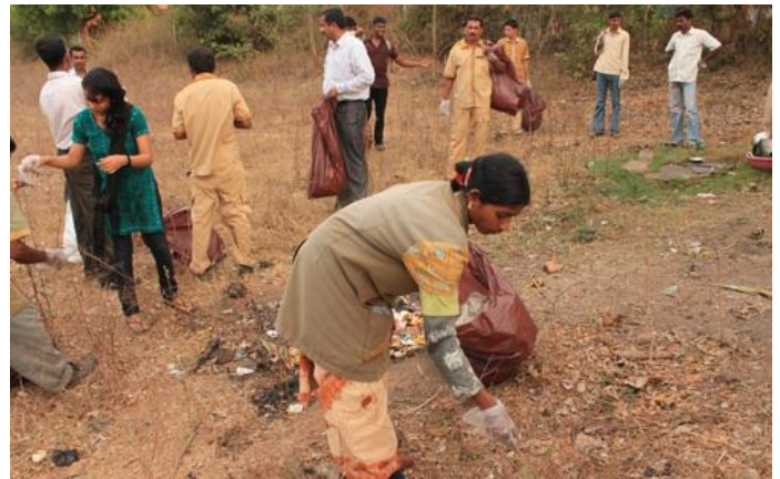
... and in local villages