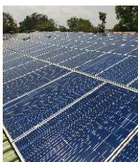
Harnessing solar power.

The infrastructure includes recycling facilities, solar power for hot water, cluster based monitoring for electricity, a 100 KLD sewage treatment plant enabling water to be reused for irrigation, and a swimming pool filtration unit for water recycling. Off-site wind farms run by the Resort's parent company, put back more energy than their resorts consume. (See Water, Energy and Waste profiles for more information).