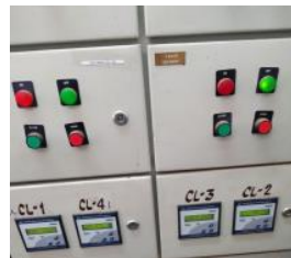
Cluster based monitoring to identify energy saving.