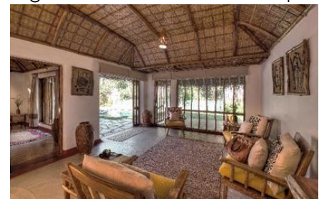
Natural light and air are maximised.

Resort buildings and the 37 guest huts are built to reflect the architecture of the local Kadu Kuruba tribe. Trees planted around buildings provide natural cooling. The use of local thatch renewed each year enables buildings to blend into the landscape. Interiors are designed to exploit natural ventilation and light to minimise energy use. Rustic furniture has been created out of waste wood.