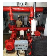
Swimming pool water filtration unit enabling water recycling.