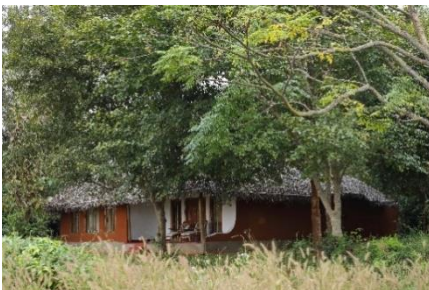
Trees provide shade and natural cooling.

The design and construction of Evolve Back Kabini, part of Orange County Resorts & Hotels, is rooted in the parent company's policy of conserving natural and cultural heritage whilst providing a high standard of accommodation for guests. Buildings occupy only about 12% of the sixteen acre plot adjacent to the river Kabini which runs through Nagarhole National Park. The rest has been transformed by planting indigenous trees and shrubs and creating a waterbody benefitting wildlife and harvesting rains to recharge ground water.