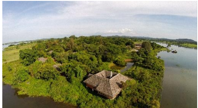
Buildings occupy approx. 12% of the site and blend into the restored landscape.