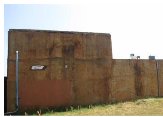
Sewage treatment plant facilitates water recycling for irrigation.