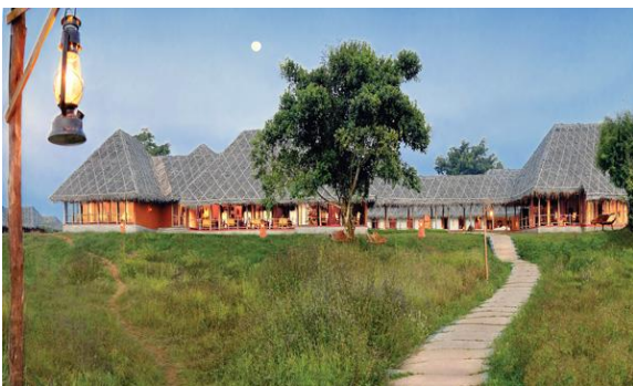
Resort buildings and guest huts are built in the style of the local Kadu Kuruba tribe using local labour and materials.

The design and construction of Evolve Back Kabini, part of Orange County Resorts & Hotels, is rooted in the parent company's policy of conserving natural and cultural heritage whilst providing a high standard of accommodation for guests. Buildings occupy only about 12% of the sixteen acre plot adjacent to the river Kabini which runs through Nagarhole National Park. The rest has been transformed by planting indigenous trees and shrubs and creating a waterbody benefitting wildlife and harvesting rains to recharge ground water.