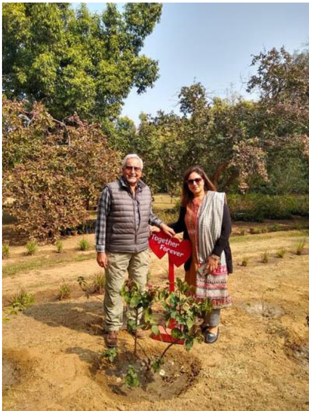
Planting for the future.

The resort has built a water hole in the park to support the forest department and helps to maintain and refill it through rainwater harvesting. It also insures over 200 forest guards. Basic equipment such as torches, water purifiers, blankets and washroom facilities have also been provided to these guardians of the forest.