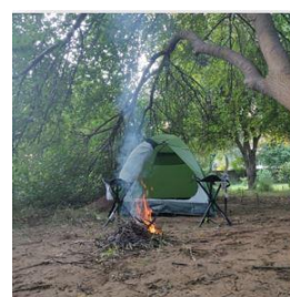
Making learning about nature and the planet fun and educational for children and young people.