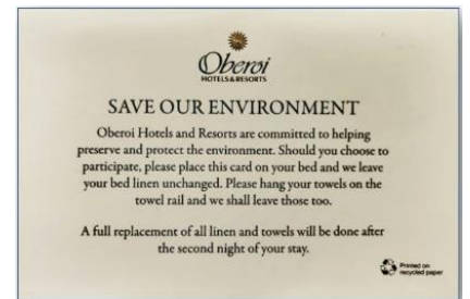
Encouraging water conservation.

Water and energy conservation are encouraged. Important national and international wildlife and green days such as Wildlife Week, World Environment Day, World Tiger Day and Earth Hour are celebrated as part of the resort's conservation activities.