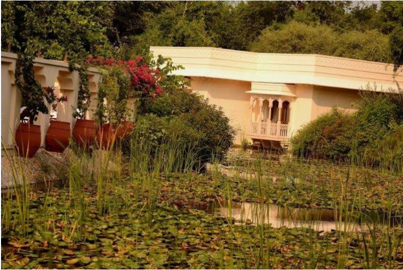
Rainwater harvesting in this picturesque lake helps to recharge groundwater levels and provide a haven for wildlife.

Thanks to their planting policy and skilful use of rainwater harvesting, the grounds at Oberoi Vanyavilas cut a green swathe in the surrounding dry area of Sawai Madhopur. The resort has planted more than 1,100 trees in its grounds. Numerous fruiting and flowering trees and the presence of water through the year, have created a paradise for domestic and migratory birds. Over 135 species have been recorded at the property.