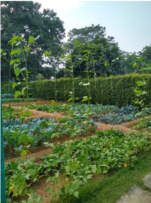
Extensive vegetable garden.

Guests of all ages can also enjoy a visit to the resort's sizeable vegetable garden and its wholesome fare – and appreciate the merits of growing your own.