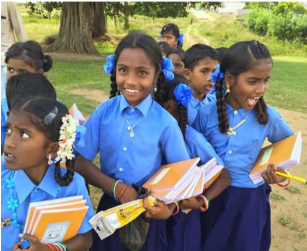
Photo: Dhole's Den Supporting local schools with educational materials.