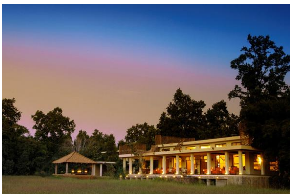
Heritage homestead retaining period features.

Retaining the features of the heritage homestead in which it is based, Mahua Kothi – Taj Safaris has seamlessly blended luxury with rustic charm. Twelve traditional mud huts, or kutiyas, have been created for guest accommodation using traditional local materials and labour. Richly coloured local textiles in shades of rust and burnt orange complement the natural hand finished lime and earth washed walls and handmade pottery roof tiles. Local handicrafts and textiles adorn the reception, dining areas and a courtyard reflecting local culture.