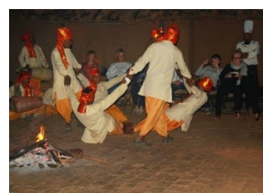
Baiga dance and music performed at the lodge.