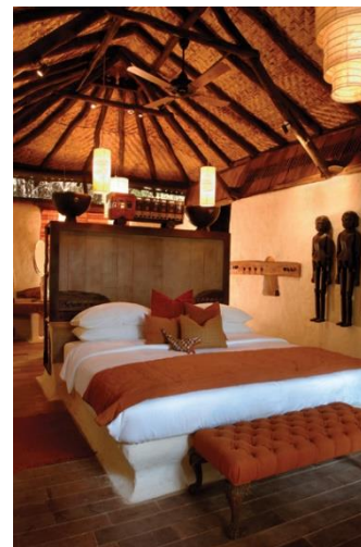
Guest room interior - reflecting local culture.

A local Gond artist is employed on a daily basis to showcase his art. A broader range of paintings, Bastar handicrafts, Baiga jewellery and other items made by local tribal communities sourced with the help of NGO Last Wilderness Foundation are on sale in the lodge's shop.