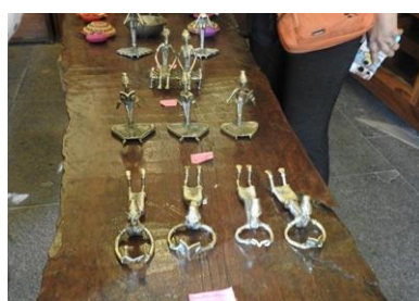
In-house shop selling local art and handicrafts.