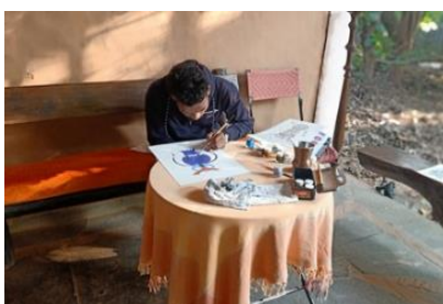
Local artist employed to showcase his art.

Traditional flute music is played by a local musician on a daily basis. The lodge also showcases Baiga dance and music traditions.