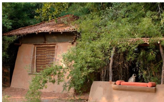
Guest cottages are modelled on traditional mud huts.

Guests are treated to the aroma of local dishes prepared on a chulha, a stone and mud mixed stove, prepared in the traditional way complementing their broader culinary offer.