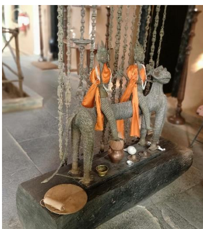
Local art is carried through the interior.