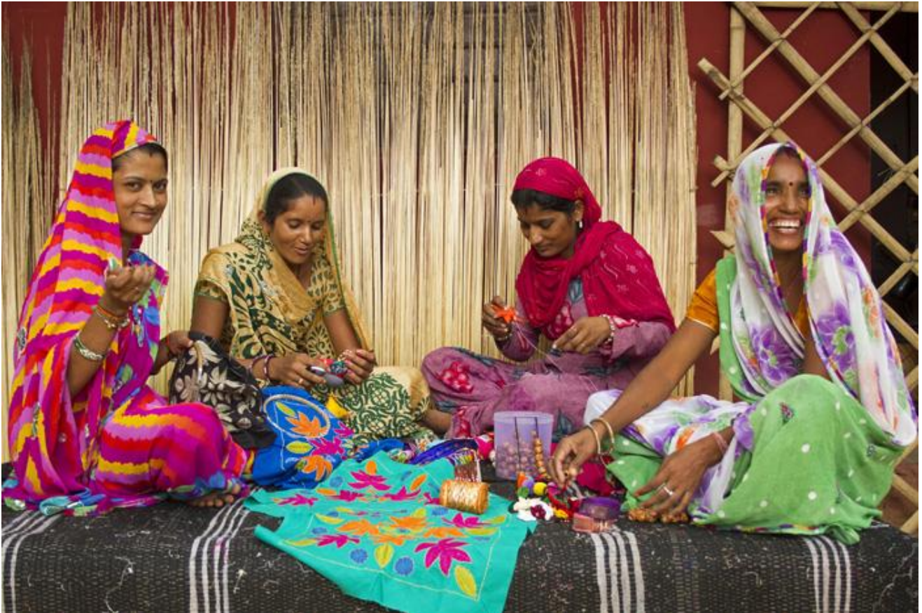
Dhank, a social enterprise benefitting from sustainable tourism through the sale of handicrafts made by families around Ranthambhore Tiger Reserve.