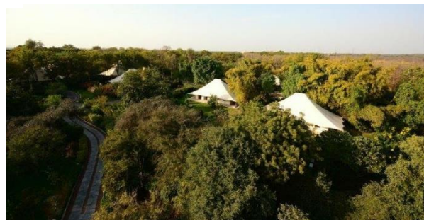
Grounds from the observation tower.