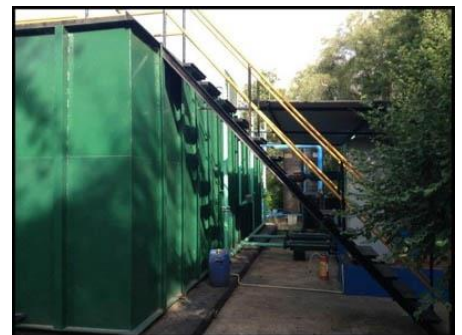
Sewage treatment plant.

The resort's sewage treatment plant enables water to be recycled for irrigation using a sprinkler and drip irrigation system reducing their use of ground water. The grounds, planted with trees, plants and naturally grown wild grasses which help to replenish the water table, cut a green swathe in the dry area of Sawai Madhopur.