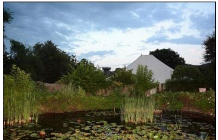
A series of pond ecosystems have been created harvesting the monsoon rains.

Oberoi Vanyavilas has created a series of lakes which harvest approximately 1,600,000 litres of rainwater each season and have become a haven for bird and pondlife. The rainwater across the property flows towards the lakes by gravity and enriches the ground water level. 135 different bird species have been recorded in the grounds including summer and winter migrants. A 300 feet deep well stores additional rainwater for irrigation.